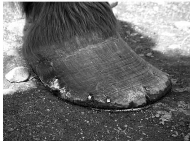
Figure 2. An example of a hoof abnormality (long toe) found among 61 draught horses in Chile.

Horses were used for carrying diverse types of loads, mainly wood for construction (44%) and wood for fuel (15%). This diversity of products has also been observed in Mexico (De Aluja 1998, Fall et al 2003). The estimated load weight was on average 415 kg ( \pm 265 kg), the most common range being between 301-400 kg (21%). There was no correlation between the age of horses and the