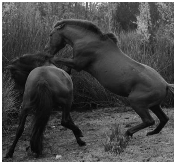
Figure 1. Caballo Fino Chilote stallion lunging against another stallion.

Potro Caballo Fino Chilote embistiendo a otro potro.