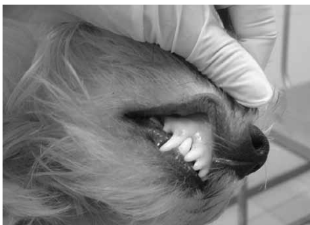
Figure 1. Pallor in 19-month-old WHWT puppy with erythrocytic PK deficiency.

At VTH – UFRGS, a macrocytic, hypochromic anemia was detected by a hematology analyzer (ABX micros, Horiba, São Paulo) and severe reticulocytosis was detected through manual reticulocyte count (table 1). The hyperchromic anemia observed in the first VTH – UFRGS exam may be due to in vitro lysis or technical artifact. On blood smear evaluation anisocytosis, marked polychromasia, and normoblastosis were present. However, no spherocytes,