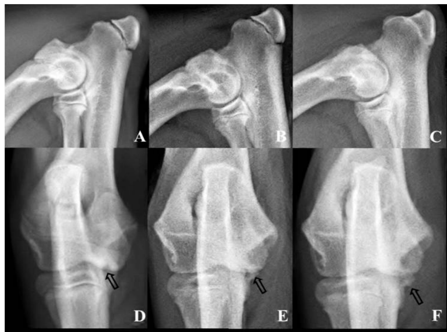
Figure 2. Medial-lateral (A, B, and C) and antero-posterior (D, E, and F) radiographs of the patient, before (A and D) and 60 (B and E) and 90 (C and F) postoperative days.

There is an increased use of platelet related products for the treatment of knee OA in human beings (Kon et al 2009, Filardo et al 2011). Platelet concentrates have also been used for the treatment of OA and OC in horses (Carmona et al 2009). The rationale for the use of this regenerative therapy lies in the fact that platelet concentrates are a source of anabolic growth factors for chondrocytes and synoviocytes, such as TGF- \beta_1 and PDGF, amongst others (Argüelles et al 2006). TGF- \beta_1 possesses a powerful anti-inflammatory effect in joints and promotes the differentiation of synovial stem cells in cartilage (Pei et al 2009). All this clinical and basic background was taken into account for treating the patient of this report with APC.