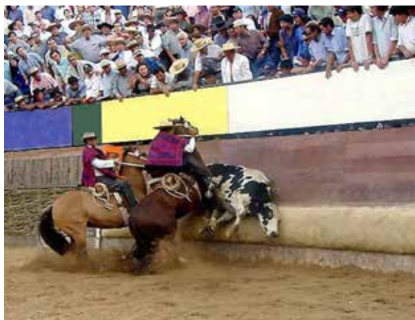
Figure 1. A: Diagram of a Medialuna used in Chilean Rodeo competitions (a: starting arena, place of beginning of the competition where the riders must guide the steer to accomplish two complete clockwise runs. b: right padded wall, where the first and last catches are performed. c: left padded wall, where the second catch is performed). B: Picture of a typical atajada (catch).

A: Diagrama de una medialuna utilizada en competencias de rodeo chileno (a: apiñadero , lugar de inicio de la competición donde la dupla de jinetes debe guiar al novillo a dar dos vueltas completas en sentido del reloj. b: quincha derecha, donde se realiza la primera y última atajada del novillo. c: quincha izquierda, donde se realiza la segunda atajada del novillo). B: Fotografía de una atajada .