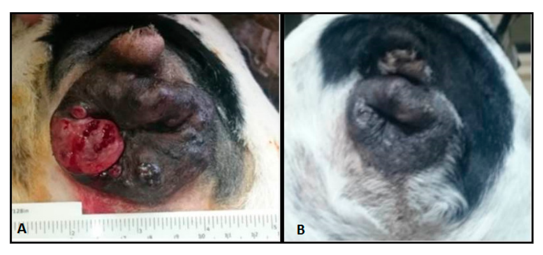
Figure 2. Anal hepatoid gland carcinoma in a dog treated with one session of electrochemotherapy (endovenous bleomycin 20 mg/m<sup>2</sup>). Before ECT (A), 2 months after ECT (B).

in immunodeficient organisms, which had a significantly lower cure rate than immunocompetent individuals after electrochemotherapy treatment (Sersa et al 1997). This might occur due to exposure of immunogenic molecules, such as calreticulin, and the release of neoplastic antigens from the cells destroyed by the ECT, which can activate immune cells against the tumor (Calvet et al 2014, Gerlini et al 2013, Gerlini et al 2012, Miklavcic et al 2012).