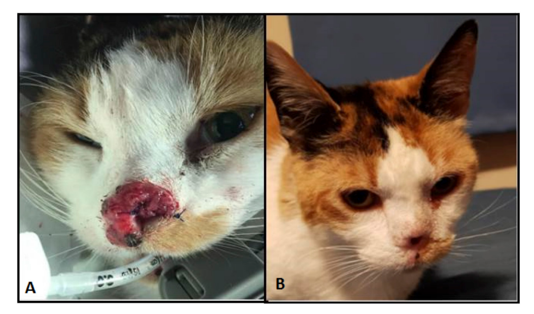
Figure 3. Nasal squamous cell carcinoma in a cat treated with one session of electrochemotherapy (endovenous bleomycin 20 mg/m<sup>2</sup>). Before ECT (A), 2 months after ECT (B).

SCC: Squamous cells carcinoma, MCT: Mast Cells Tumor, STS: Soft tissue sarcoma, CTVT: Canine transmissible venereal tumor, MT: Multiple tumors, Bleo: Bleomicina, CIS: Cisplatin, it: intratumoral, ev: endovenous.