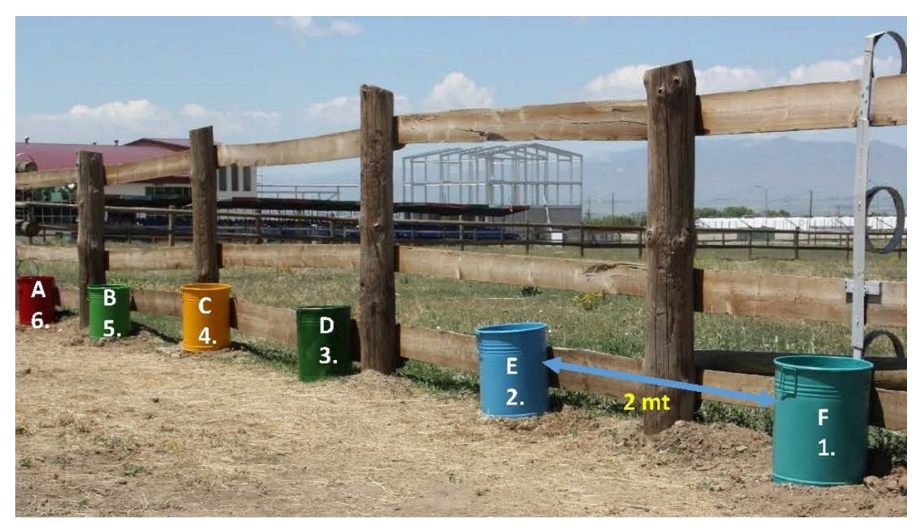
Figure 1. Colours and rows of the buckets used in the study. (A) red, (B) light green, (C) yellow (D) green (E) light blue, (F) turquoise. (1.) 1st row, (2.) 2nd row, (3.) 3rd row, (4.) 4th row, (5.) 5th row, (6.) 6th row. A total of 12 buckets of 6 different colors (2 buckets of each color) were used in the study. There were about two meters between the buckets, which were attached to the side fences with rope. Each day, the buckets were shifted by one row, and thus the buckets were each tested in all positions.

the study area, a hard (nonpliant) and narrow-mouthed (preventing water from spilling into the environment) plastic jerrycan was used to pour 15 L of water into the coloured buckets. The amount of water poured into this plastic jerrycan was weighed as gram with a weighing instrument (TEM Industry and Trade Limited Company®) for easy measurement.