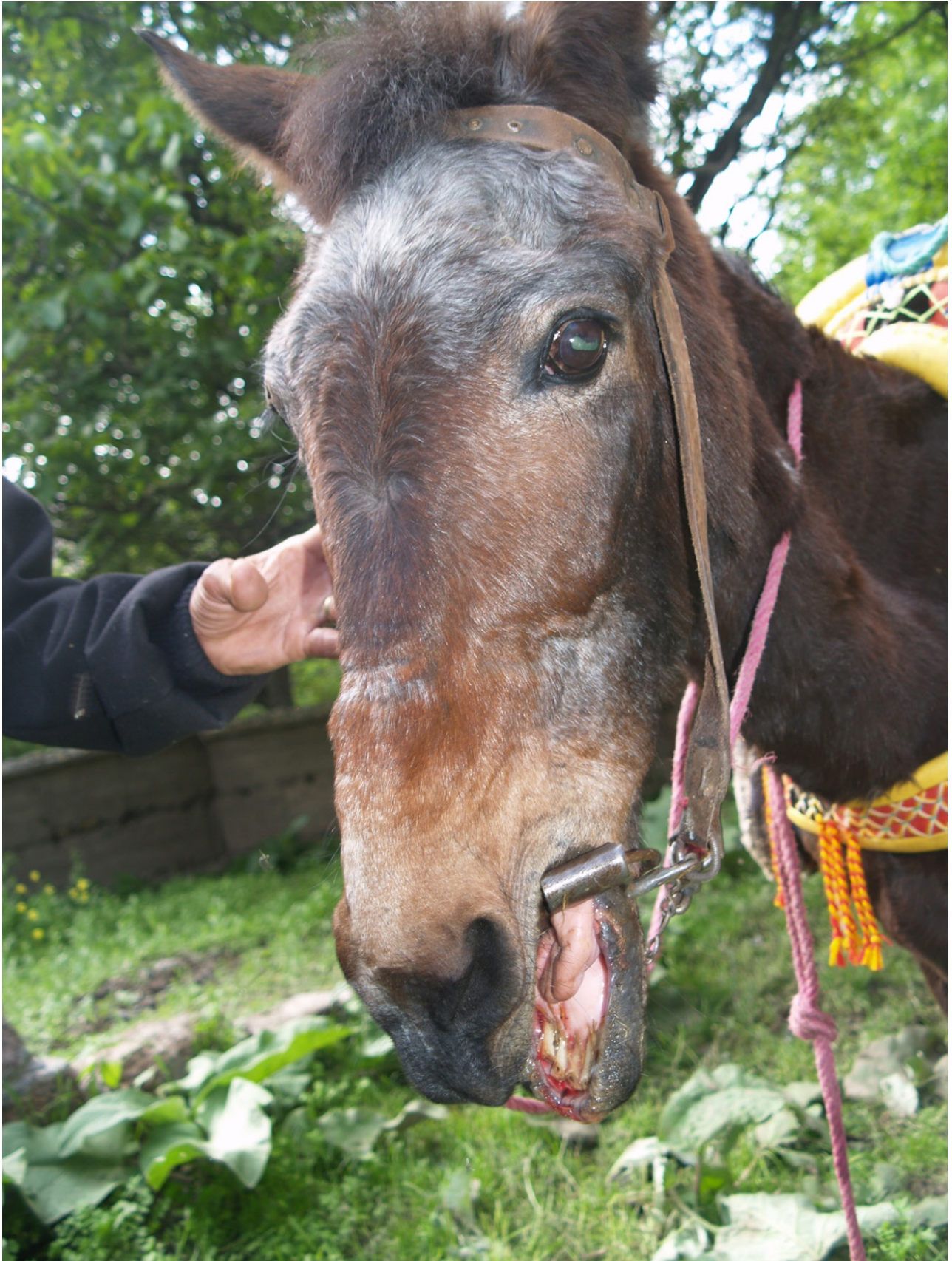
Figure 2b. Hassan's mule, when viewed from the front, has a fearful and pained look to her. There is blood pooling inside her lower lip and the traditional bit that has been used to force her to work is hanging from her mouth.