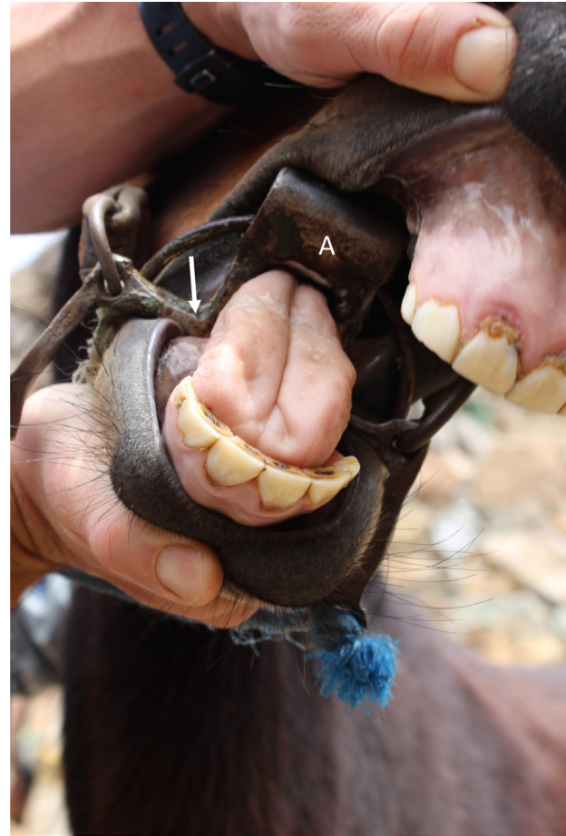
Figure 4. This young mule has a traditional bit in her mouth. The bit's action commands her attention. The right-angled bar of the bit (arrow) is in contact with the bars of the mouth and can easily traumatise both the bars and the sublingual tissues. The port (A) is raised into the roof of the mouth when the reins are pulled, forcing the mouth open.

The shift from I-in-Me attention where the ego's world view is downloaded requires a shift into curiosity that allows disconfirming information to be noticed. This can be