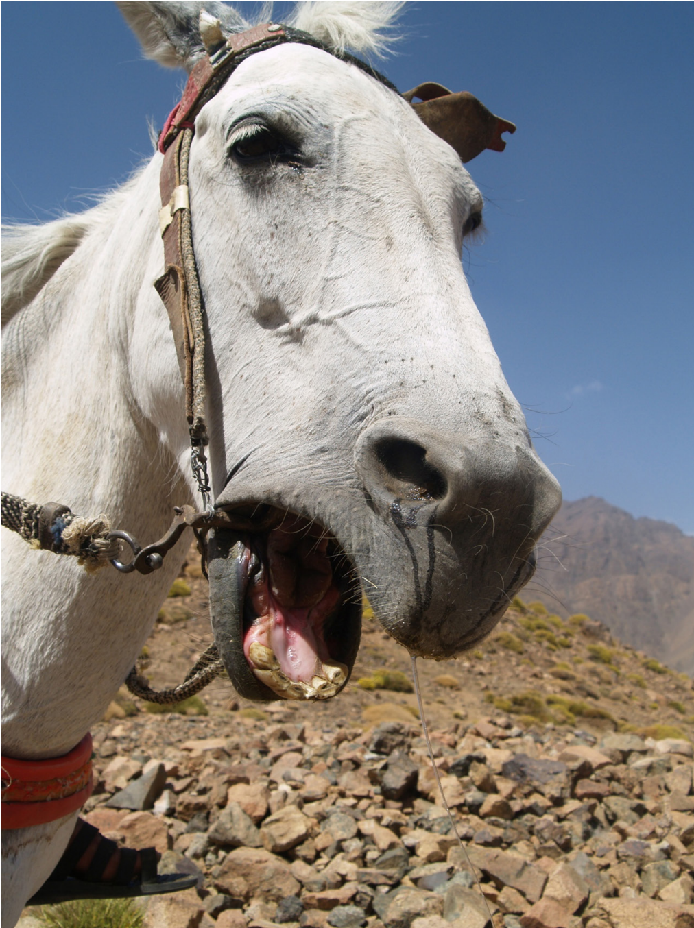
Figure 5a. A sharp yank on this mule’s reins forces the mule’s mouth open and brings the mule to an abrupt stop. The nostril is flared and the mule appears to be crying.