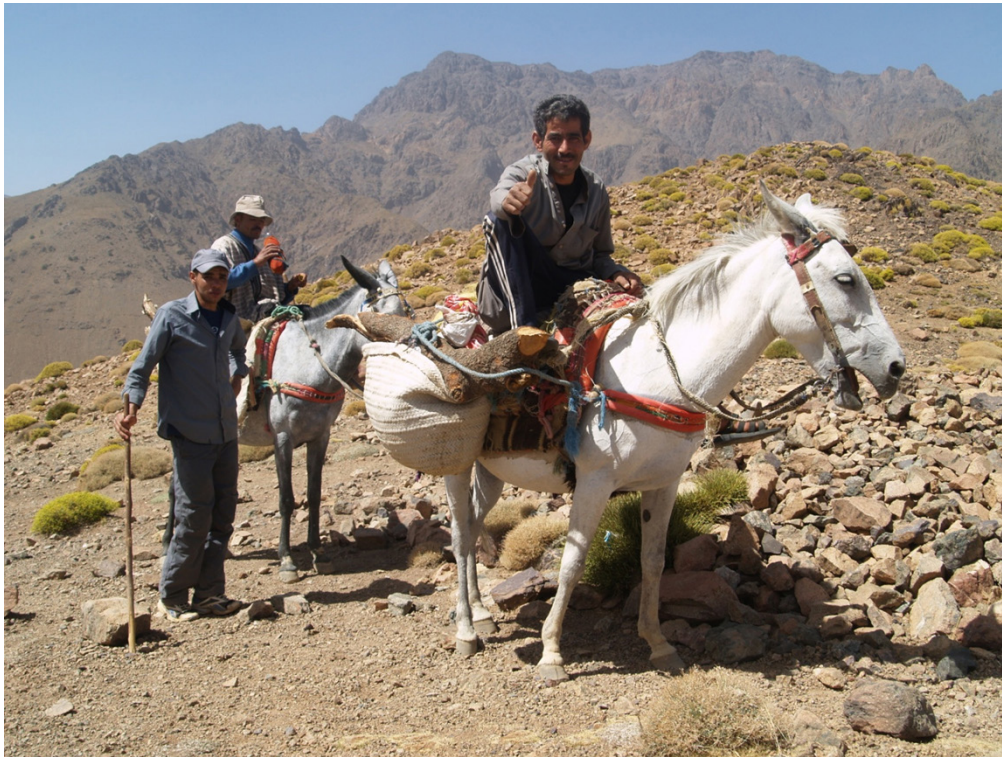
Figure 5b. The same mule continues to hold her mouth open after being stopped. Her ears are back, she is clearly uncomfortable and distressed. The bit thus ensures that she attends to her master even if he does not attend to her. The bit is not designed for this for it is a monological device.