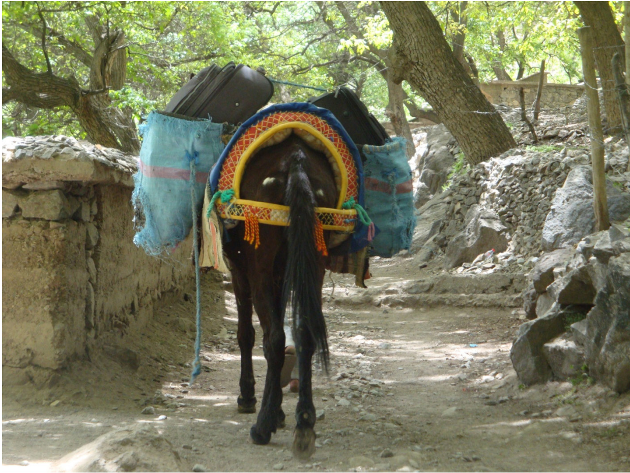
Figure 2a. Hassan’s emaciated mule labours up the path, carrying the suitcases of a holidaying couple who have walked up separately, oblivious to the state and suffering of the mule carrying their bags, oblivious to the traditional bit and horrendous injuries in her mouth, oblivious to the lack of polices in place to protect mule welfare. They, of course, were on holiday! And, as such, oblivious to their responsibilities. But who would spare this mule a second glance and, attending to her respectfully, recognise her emaciated state? Who would see and feel and act on her behalf?

unknown to all those 14 who exploited her failing body, this mule had suffered extensive trauma to the bars of her mouth, resulting from the abuse of the traditional bit (Figure 2c) that had been used to drive her on and keep her working.