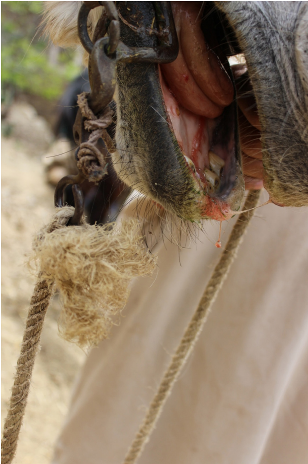
Figure 3. The blood-tinged froth on the gums and lips of this mule, the similarly coloured drop of saliva that is about to fall from this mule's lower lip might draw the attention to the fact there is an injury within the mule's mouth. The curled tongue, the open mouth, the owner's clenched fist, the control, the unnaturalness of it all, might all invite curiosity and concern... The easily missed bloody saliva prompted me to undertake an oral exam and determine the location and nature of the injury. This is not something the average owner, guide or tourist would ever do. It requires skill, confidence, curiosity and consideration.

the “culture of do and tell” dominates and we fail to inquire humbly of the other (Schein, 2013) and fail to see that with great power comes great responsibility.