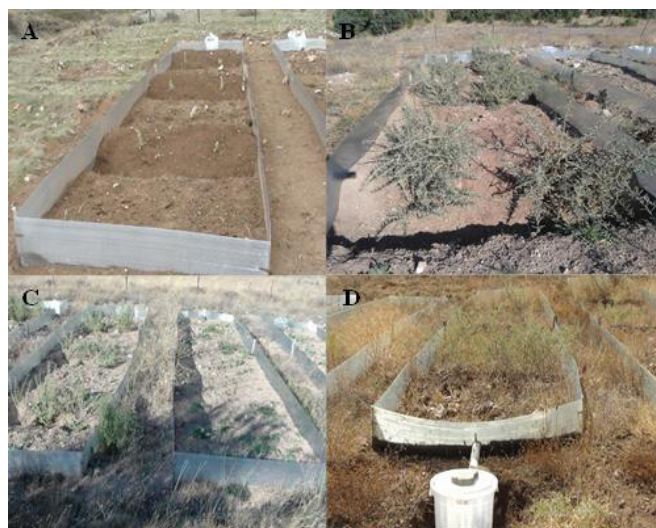
Figure 3. Some parts of the treatments in the research area (A: terrace treatments at the beginning of 2015, B: terraces treatments at the end of the 2015 with bushes, C: control plot (right) and dig pits with plants (left) in 2015, D: terrace treatments with bushes and herbaceous plants in 2016).

Medición de escorrentía en el área de investigación. A y B: vista general del área de estudio, C: evacuación de escorrentía y sedimentos, D: mecanismo de recepción de escorrentía y sedimentos.