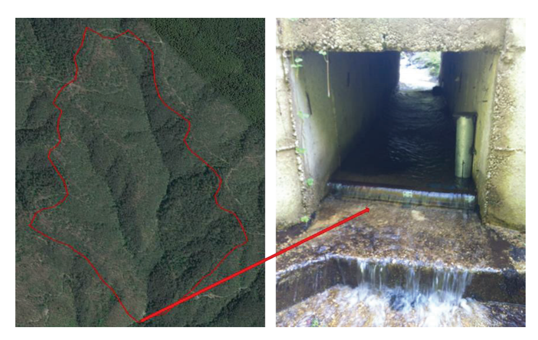
Figure 2. Box culverts at the discharge point of watersheds. Alcantarillas en el punto de descarga de las cuencas hidrográficas.

Statistical analyses. We tried to put forward the relationships between water yield and a variety of characteristics of the watersheds with the help of the multiple linear regression analysis. In these analyses, water yield is considered as a dependent variable and watershed area, circularity ratio, elongation ratio, form factor, drainage density, mean slope and elevation are considered as independent variables. To check if there is an autocorrelation among independent variables or not, Durbin-Watson test was implemented. In the regression analysis, first, the relationship between water yield and all available variables was analyzed; next, gradually, the ones presenting low-level effect were removed from the analysis.